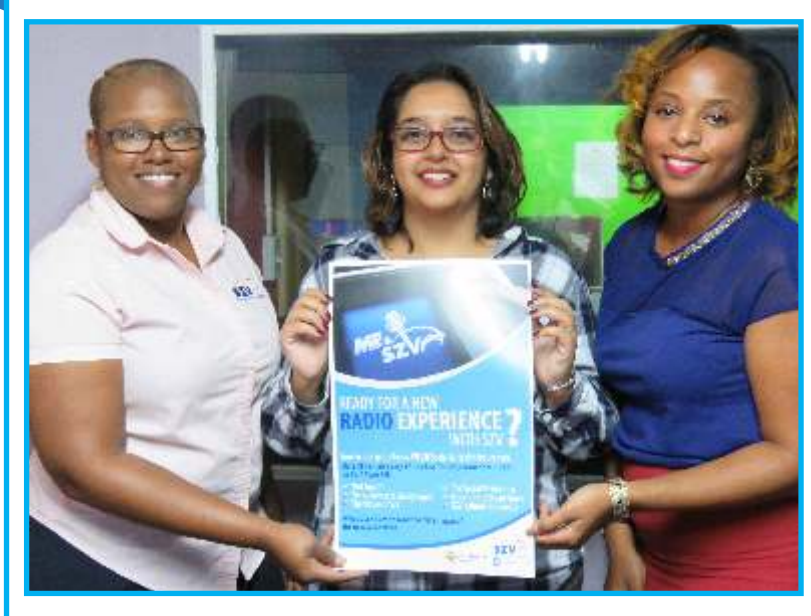
SZV representatives during launch of 'Me & SZV' radio show.

While you are reading this article, chances are that there is also an SZV message being played on the radio right now. SZV has expanded its communication channels and we are using radio to share general information about our services, procedures, updates