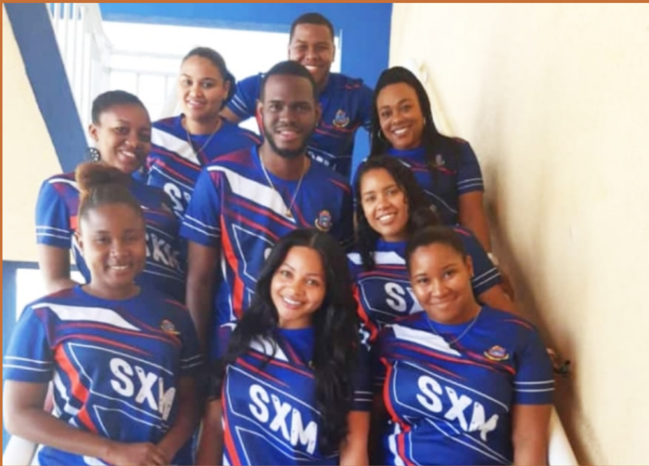
The staff of Audit Team St. Maarten (ATS) celebrated November 11th in full team spirit.

The Audit Team Sint Maarten (ATS) supports SZV by increasing compliance amongst employers. The team helps to promote the regular payment of the legally indebted social security premiums, ensuring in this way that all companies pay their fair share in accordance to the Social Security Ordinances. For more information about Employer compliance visit www.szv.sx .